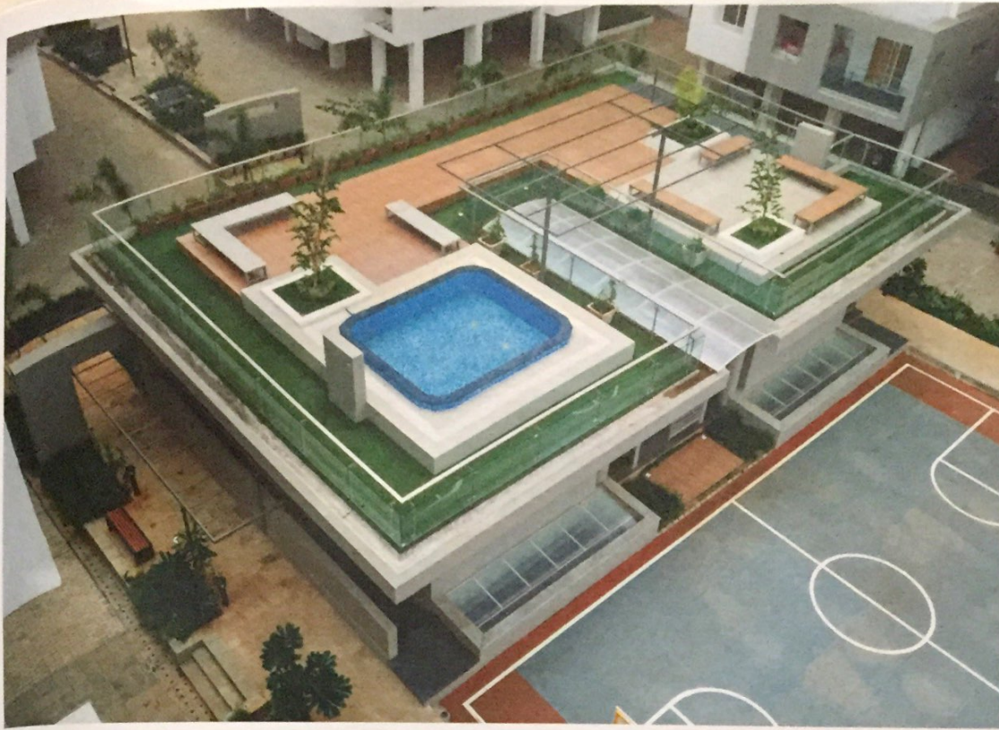
Top: space is utilised effectively by converting the roof of the multipurpose hall into a rooftop garden area with seating and a paddle pool for children. Centre right: the use of pergolas, asymmetrical blocks and glass railing create an interesting play between shadow and light. Bottom right: Wind Gates blends functionality with nature to create spaces where residents can relax.

cherry create a soothing ambience. The trees invite nesting birds, and seating accommodations are provided under the shade of the trees so that residents can enjoy the scenery.