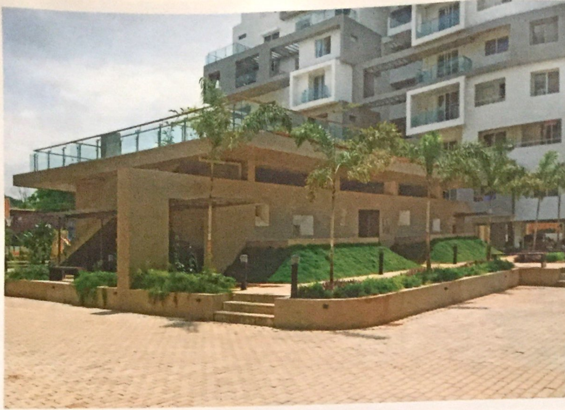
Top: strategically planted palm trees obscure the height of the multipurpose hall. Centre right: benches placed amongst the foliage encourage residents to embrace nature. Bottom right: the basic concept of massing and blocking is further reflected through its water sculpture.

grids. The recessive order of the blocks leading up to the penthouse on the sixth and seventh floors give the structure a unique skyline and afford wider sky views from the central interaction spaces.